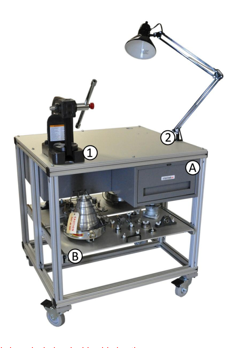
NOTE : Cart pictured above includes double-sided option.